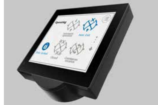
The user-friendly touchscreen mode selector will become standard for all Besam revolving doors.

"The revolving door acts as a barrier between climate zones."