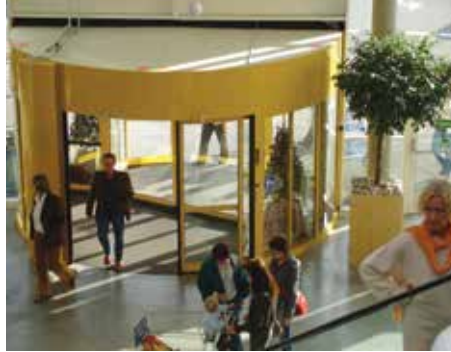
Optimum comfort with an additional, matching air curtain for a two-wing Besam UniTurn.