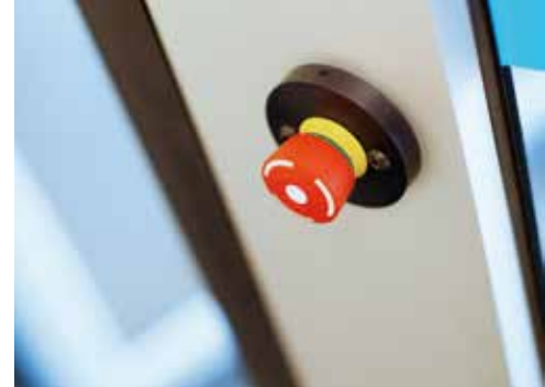
Pedestrian safety is a top priority.