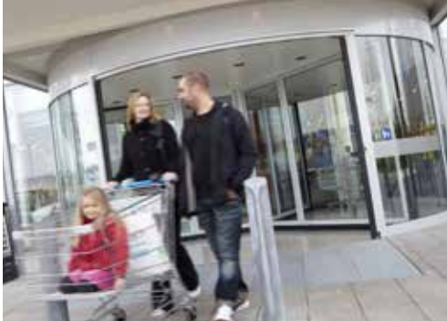
The high-capacity three-wing revolving door at a supermarket is ideal for shopping carts and wheelchairs.