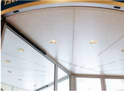
Down-lights in the fully rotating ceiling of the high-capacity, three-wing Besam RD3L revolving door.