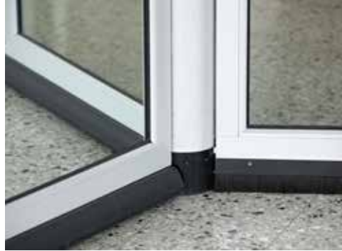
Besam high-capacity revolving doors provide safe and reliable operation.